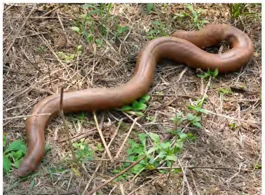
Fig. 2L. Red Sand Boa Eryx johnii .